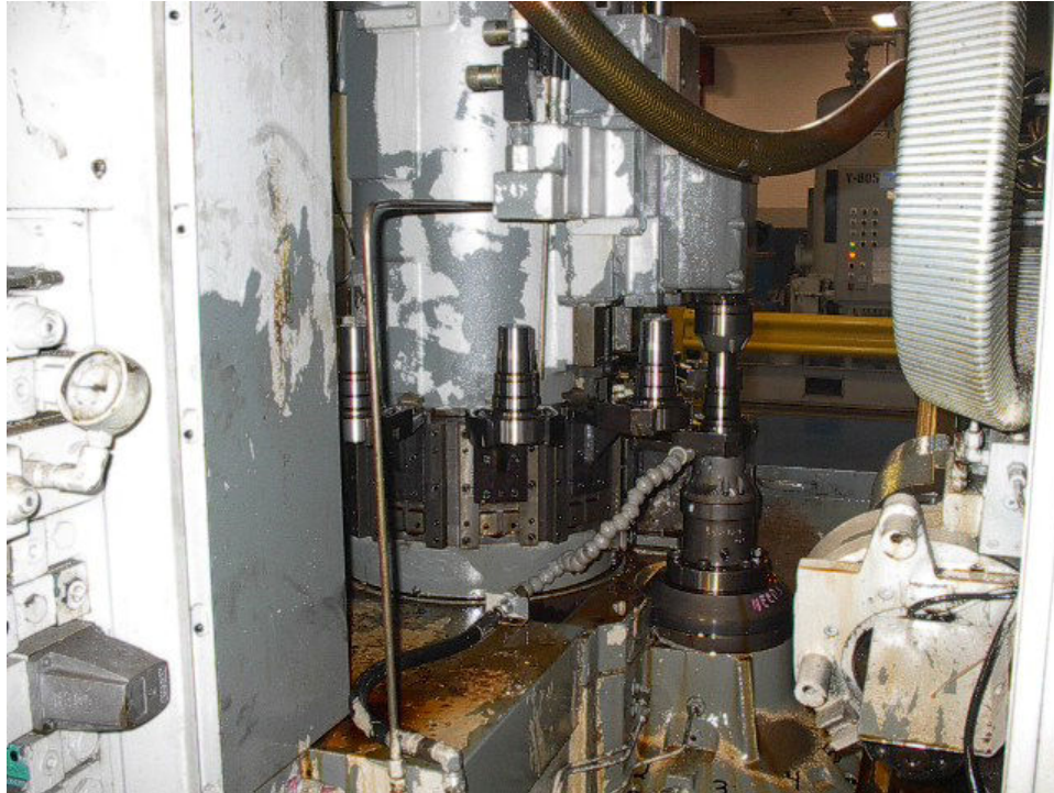
Part Carousel and Hob Spindle

The parts are continuously loaded and unloaded from the front of the machine. The Hob makes a quick pass through the part then retracts to a clearance position and gets ready for the next part. The part is unclamped and the carousel indexes to move the finished part out and a blank part into position for machining. As soon as the blank is in place, it is clamped and the Hob Cycle starts again. All this is coordinated between the Control Logic and the part program. This functionality is quick and very reliable!