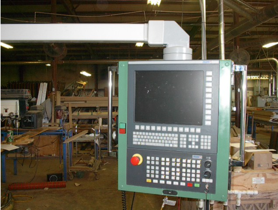
Operator pendant on arm